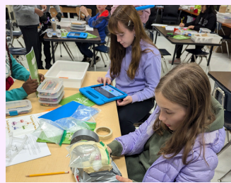
STEM students design vehicle crash protection using Sphero RVR+ for testing

Creating a Spark for STEM Career Pathways