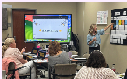
The Elementary Math Leadership Team working on best practices of the Number Corner program.